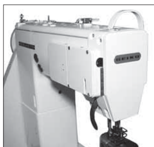
Open/close simplified face plate and upper feed mechanism

Two needle, compound feed and walking foot, reverse stitch, thread trimmer