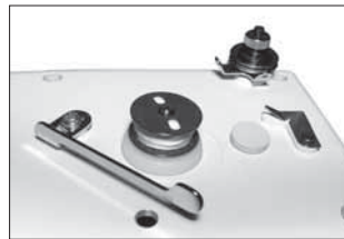
Built-in bobbin winder