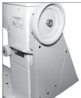
Large pulley (O.D. 150mm)