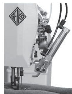
Central guide (option)